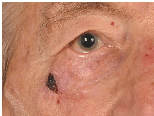
Figure 2 Exemplary image of an infraorbital BCC that was partially covered by the patient's face mask in an 81-year-old male patient from a single household.

The lesion in question was partially covered by the face mask in 32 (12.5%, for exemplary image see Figure 2 ) and fully covered by the face mask in 20 (7.8%) patients. The infraorbital and lower lid lesions were not covered by the face mask in 205 cases (79.8%).