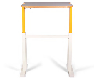
Figure 1. Model of the used sit-stand table created by Rocket-Table GmbH.

ergonomic working position. After the implementation of the tables, the children were shown how to work with the height-adjustment and then were able to choose sit or stand positions freely during the lessons without the need of support. No targeted daily sitting or standing aims were prescribed to teachers or children, and the height of sitting and standing positions was not assessed. The children kept their traditional chair for sitting times.