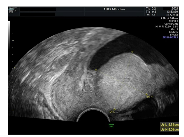
Fig. 1 Transvaginal ultrasound with uterine mass. Transvaginal ultrasound of the cervix and uterine isthmus on admission of the patient with 24 6/7 weeks of gestation. The mass was initially assessed as a fibroid but was later confirmed as a clear cell endometrial carcinoma in the pregnancy via obtaining a specimen at caesarean section

The preterm male, 980 g (APGAR 5/7/9) was admitted to the neonatal intensive care unit after intubation due to